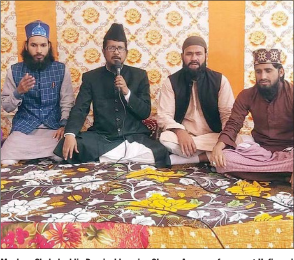
in Uttar Pradesh's Bareilly district.

MI News Tender value: ₹ 2,17,59,419.40. Bareilly: The Ghause Azam movement was launched to counter lies and deceit as the revered Sufi saint Shaykh Abdul Qadir Jeelani, popularly known as Ghouse-e-Azam preached against violence and radicalisation, emphasized participants at a conference here to highlight the role of the founder of the Qadiri Sufi order.