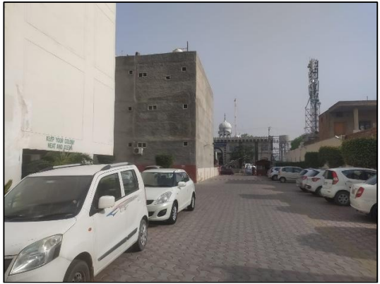
Photographs showing parking area