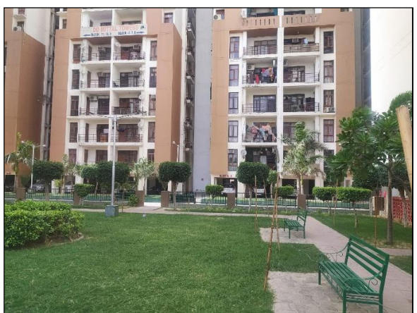
Photographs showing green area within project premises