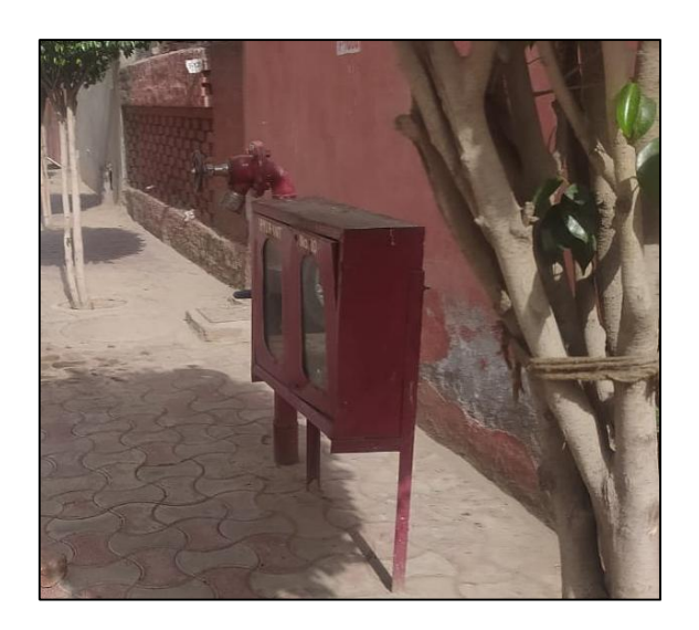
Photograph of fire safety measures