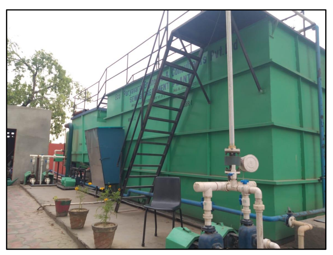
Photograph showing ETP provided within project premises