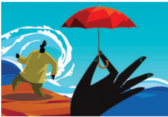
ILLUSTRATION: BINAY SINHA

It may be recalled that Irdai is pushing the Bima Trinity - Bima Vistaar, Bima Vahak, and Bima Sugam. The BC network, over 500,000 strong with a